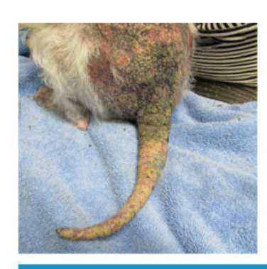
Severe hairloss & crusting on a dog's rump and tail due to ringworm